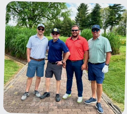
Champions Golfing for Kids