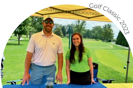
Golf Classic 2023

Benefiting our Owensboro Mike Horn Unit Club members