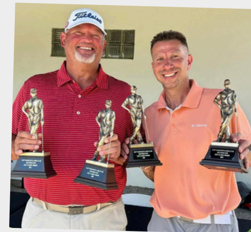
2024 Golf Classic Winners AM: Liberty Federal Credit Union